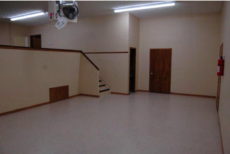
Large Open Area