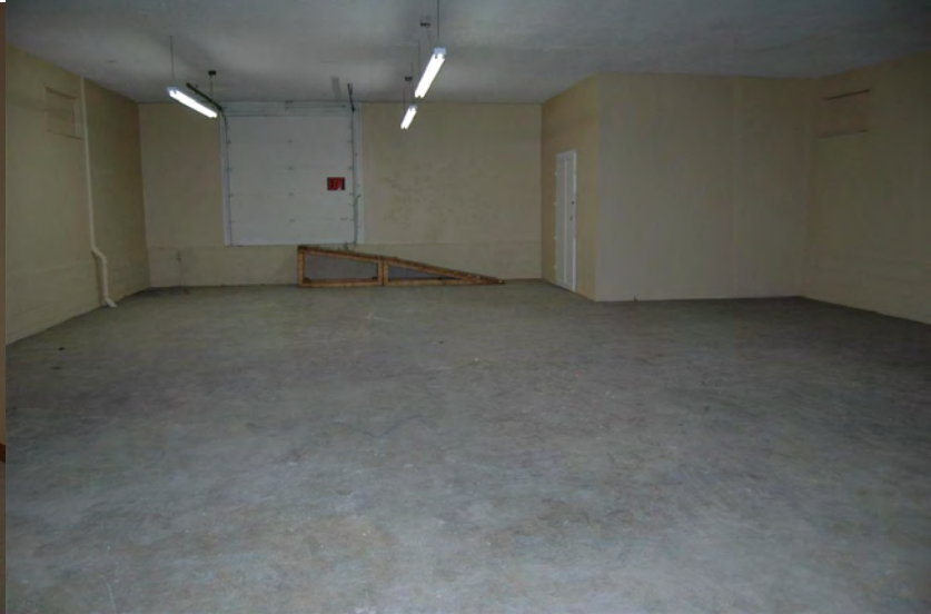
Warehouse/Work Shop Area