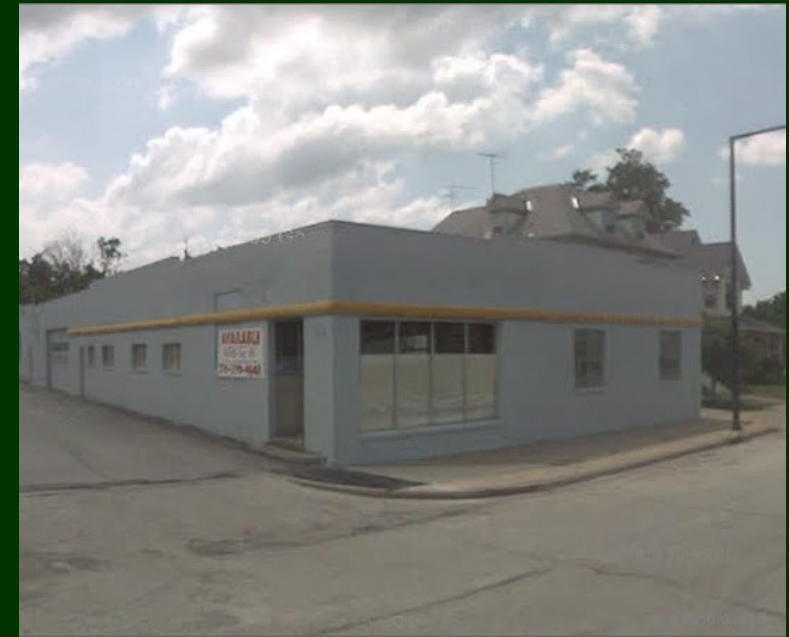
414 2 nd Street, Elyria, OH

No warranty or representation, express or implied, is made as to the accuracy of the information contained herein. It is submitted subject to errors, omissions, price changes, rental or other conditions, withdrawal without notice, and to any special listing conditions imposed by our client.